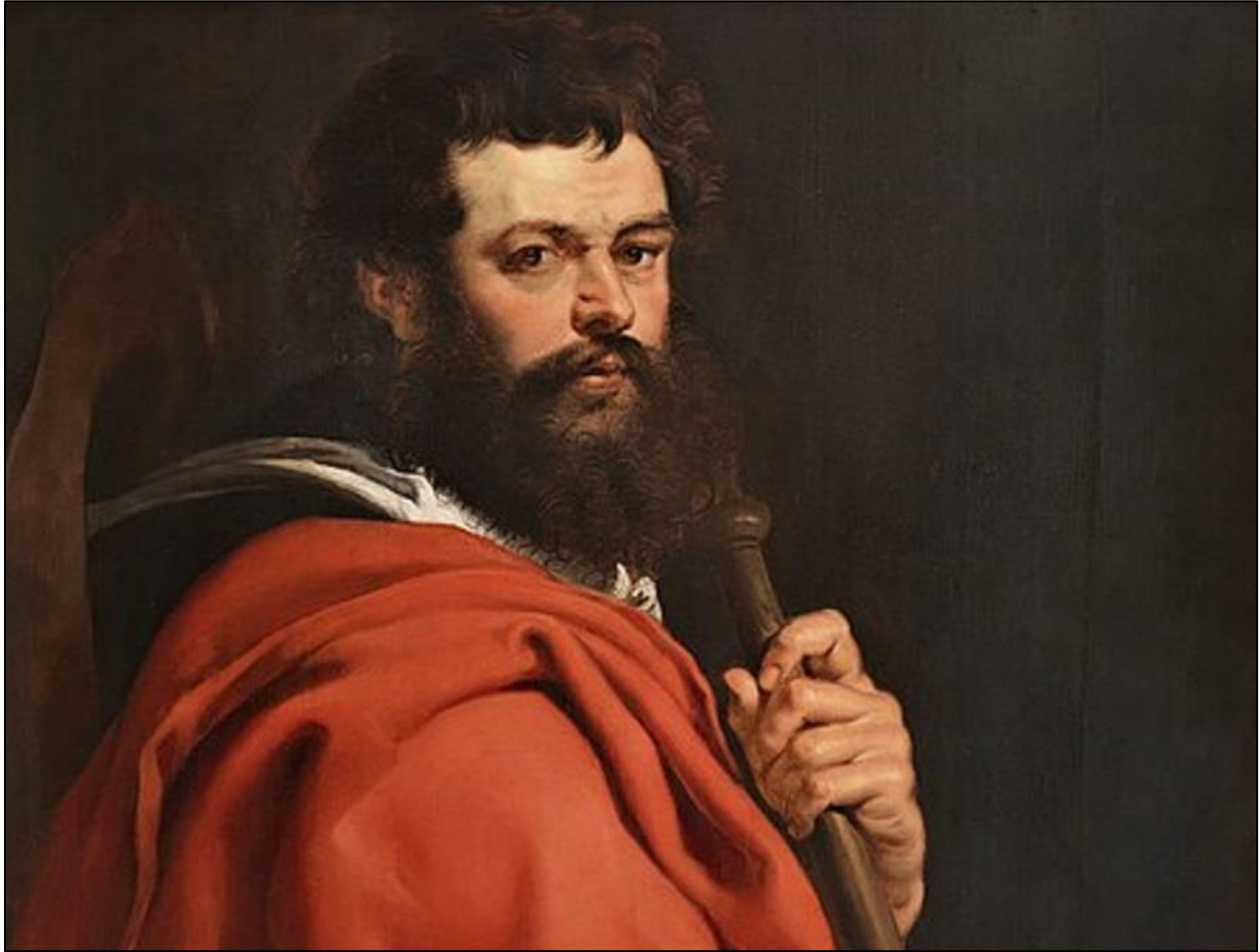
“Saint James the Apostle” by Peter Paul Rubens