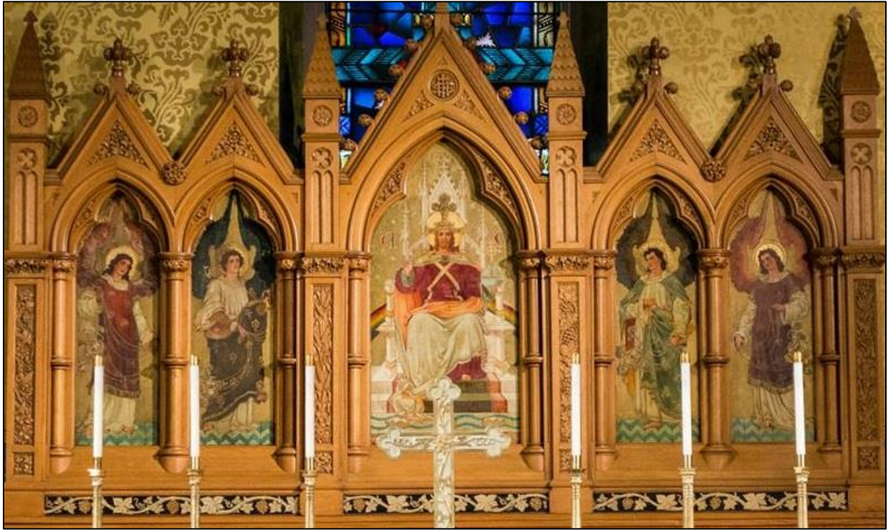
The Cathedral Reredos

Holy Eucharist Last Sunday after Pentecost: Christ the King November 24, 2024 at 11 a.m.