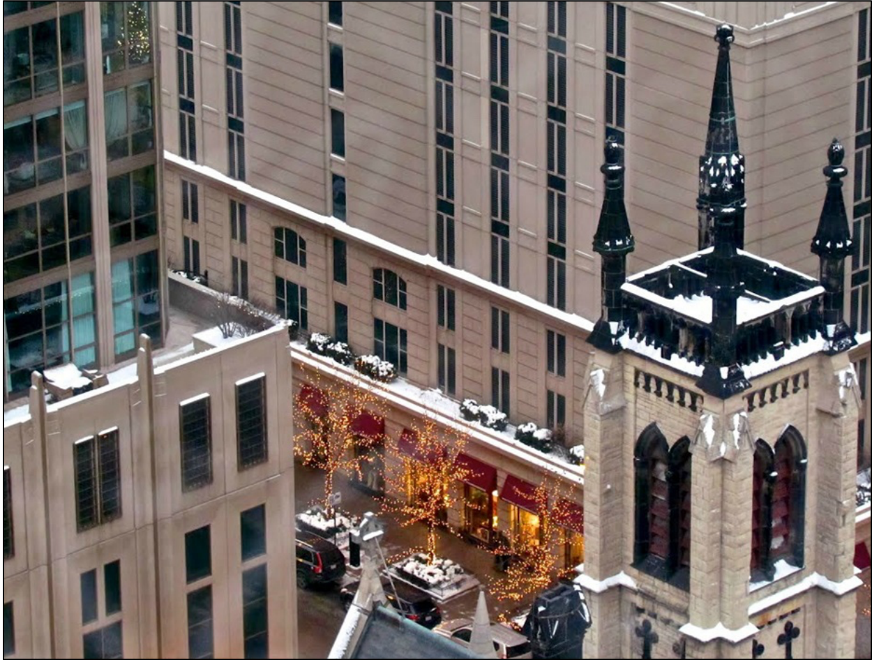
St. James Cathedral Bell Tower on a Snowy Day